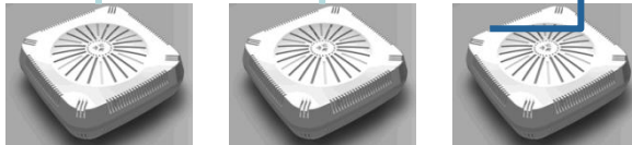
ECW5110L Unified Enterprise Access Points